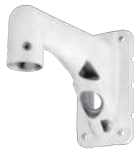
WV-QWL501S-W Wall Mount Bracket